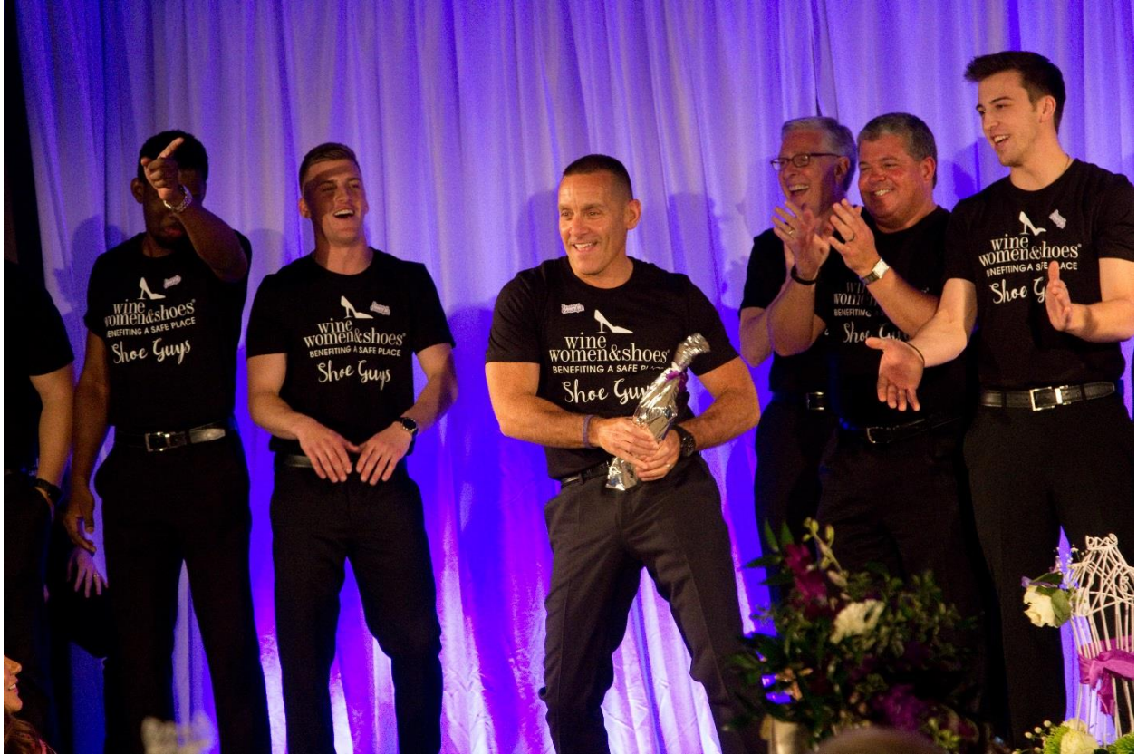
Photo 3: A Safe Place presents domestic violence statistics in Lake County and the United States.